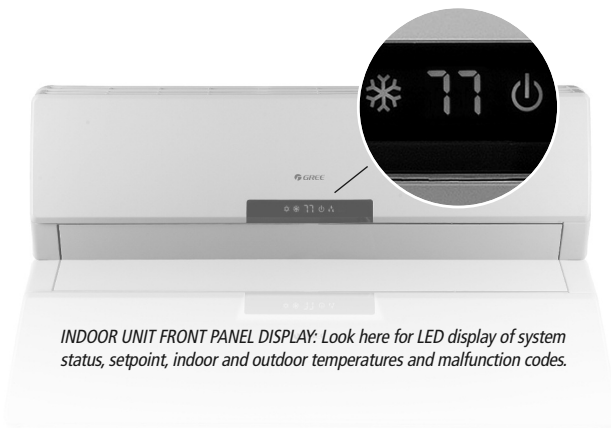
INDOOR UNIT FRONT PANEL DISPLAY: Look here for LED display of system status, setpoint, indoor and outdoor temperatures and malfunction codes.